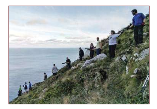
The chain gang moving Rhododendron wood piles on the East Side slopes.

The day off in between the wood shifting was a very good one weather-wise and a welcome break. It was thoroughly enjoyed by everyone, but for most, if not all, it was not exactly restful. Activities included walking and exploring, bird and seal watching, wild swimming, fungi hunting, descending to Lametry Bay, and visiting the museum and the recently refurbished church. These pastimes also filled up much of the rest of our spare time.