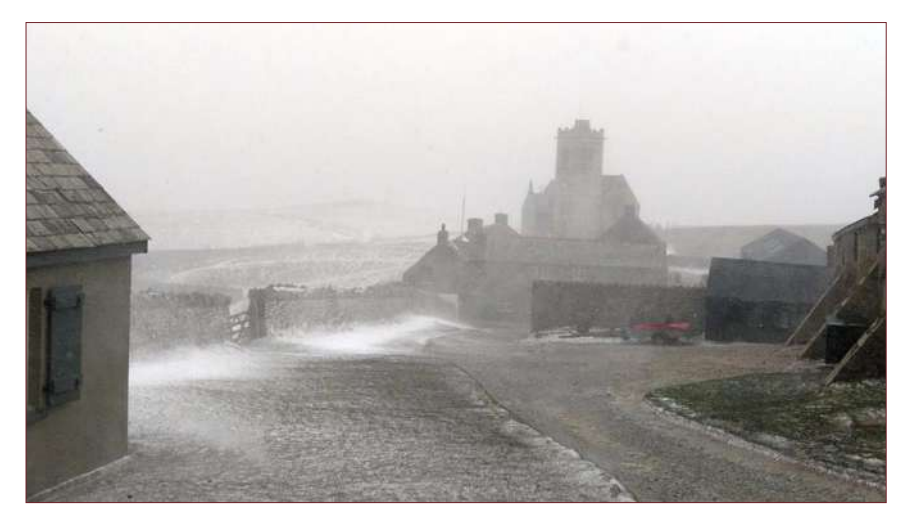
Storm Emma from the Barn.

Y is for the YEARNING to return in weeks or days, To witness Island wildlife and all its healing ways, Though storms may rage and winds may blow the sun will shine again, May the mainland be gentle and kind to you 'til we commune with Lundy again.