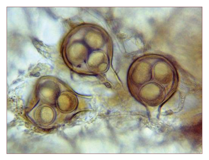
Saprolegnia litoralis.

The unexpectedly varied results are shown in the table below. Quarter Wall Pond apples had attracted the most diverse 'water moulds', including pustules of the Chytrids Blastocladiella pringsheimii and B. ramosa and white cottony growths of the Oomycete Saprolegnia litoralis , which forms rounded structures containing thick-walled 'oospores' (pictured under the microscope in the photograph). This water mould also appeared on the Widow's Tenement apples together with Achlya sp., a related organism, but no Blastocladiella was found. Surprisingly Rocket Pole Pond apples had no water moulds on them.