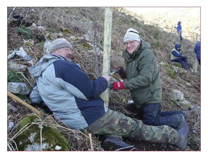
Transplanting trees on the East Side slopes.

F is for the FRIENDSHIPS made, both old and new if you will, Stories shared, lives compared, Souls meet – time stands still. But perhaps it is Lundy Island that really makes its mark, Draws you close and hugs you tight, engraves itself upon your heart. And in return we, with each step on Lundy our marks we lay, Our footprints planted in its earth remain long after our stay, And from those prints you'll carry some earth and leave it at your door, "But before too long you'll return to me and feel my power once more..."