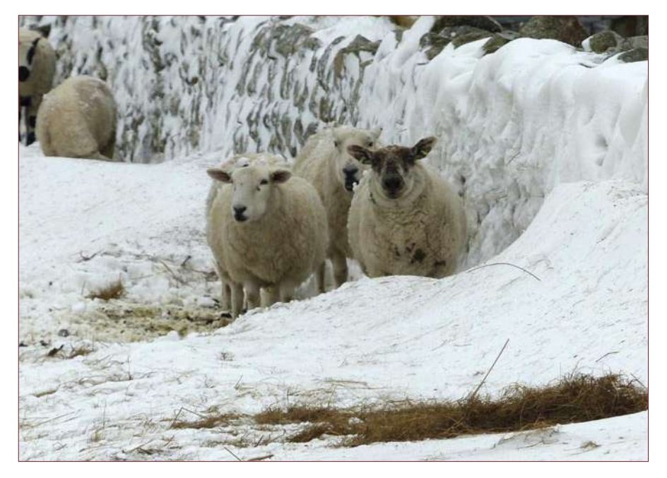
Sheep in the snow.

C is for the CHARADES with which we passed the evening hours, "TV, two words, sounds like Halt"– "I've got it, it's Fawlty Towers!"