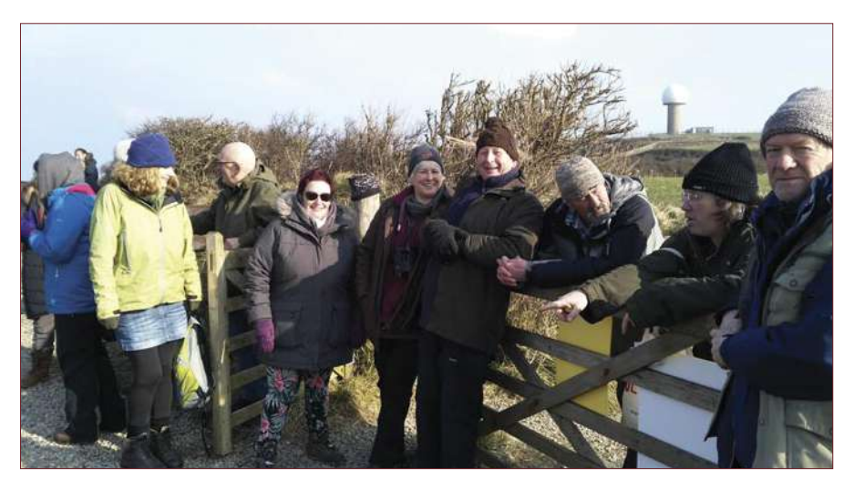
Some of the February Conservation Break team at Hartland International.

N is for the NATURAL life contained within these shores, The young, the old, the weak, the strong, just step outside the door, Some creatures braved the winter storms and some didn't fare so well, A snipe, Neil the eel, a Raven, a Deer sadly by the wayside fell.