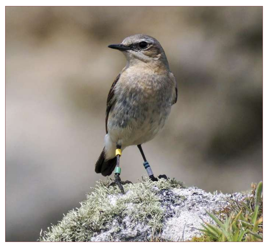
A colour-ringed Wheatear photographed on Lundy by Elisabeth Price in June 2016.