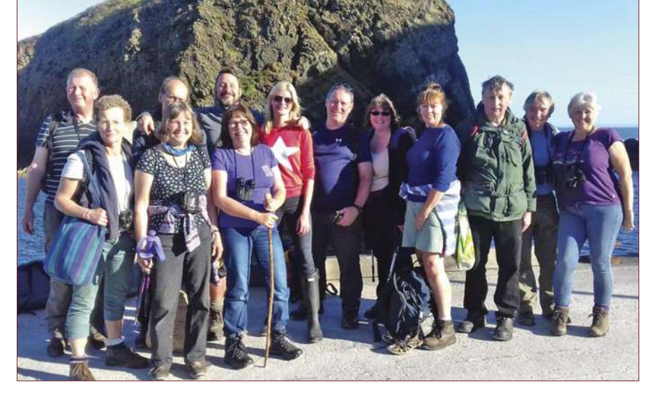
The October working party bond on the Jetty at the end of their week.

Friday was very varied for the group. While a few started the day with sorting the accumulated recycling, another group toiled in the Old Light, sweeping steps and cleaning windows. The gravestones in the cemetery were tidied up, and the posts and fencing along the cemetery wall were replaced, including rehanging the gate.