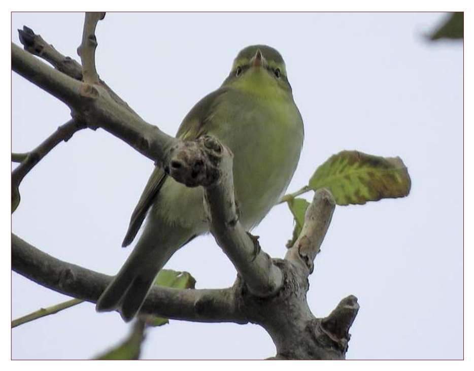
Lundy's first Green Warbler in Millcombe Wood.

unsuccessful minutes trying to relocate we had to hurry off for house-keeping duties, having offered some voluntary time to support island staff.