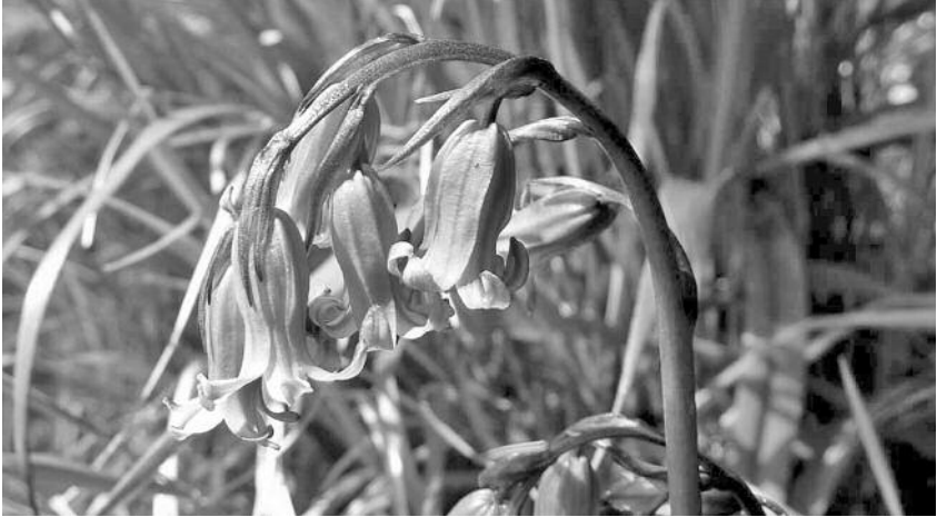
Native bluebells in Millcombe, May 2010.