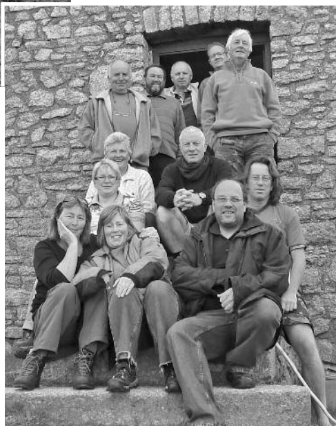
The September 2010 LFS Volunteers.