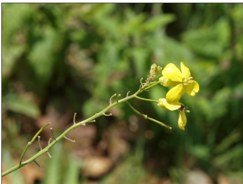
Plate 2: Inflorescence of Lundy cabbage showing developing fruits and bare stalks where there has been no fruit set

Lundy cabbage inflorescences mature from the bottom up, so that basal fruits, more central flowers and terminal flower buds can all be present at the same time. Any flowers that fail to set seed abscise and leave behind the short pedicel. The relative numbers of pedicels and fruits can provide an indication of the proportion of 'successful' flowers (Plate 2) and in the past the proportion of flowers that managed to produce fruits has been used as an index of pollen beetle damage to oilseed rape. However, this needs cautious interpretation, because in addition to insect feeding, climate, soil nutrition and pollination rates can all influence the ratio of successful/unsuccessful fruit set (Williams & Free, 1979; Kirk, 1992; Bartomeus et al. , 2015).