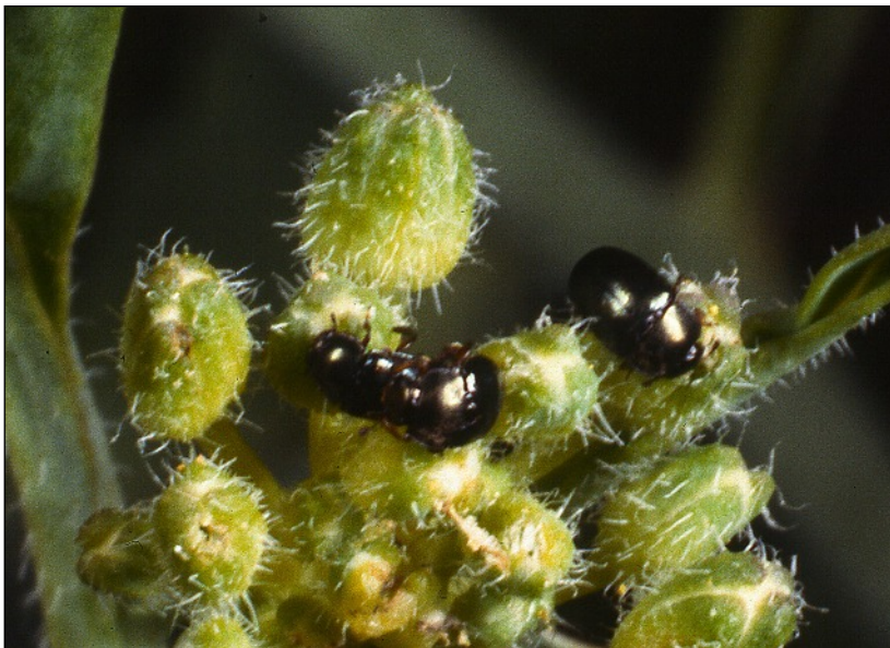
Plate 1: Brassicogethes viridescens (pollen beetle) adults are the most common and easily-seen beetles on the flowers of Lundy cabbage. They are often mistaken for the endemic Lundy cabbage flea beetle

Lundy cabbage is unique among the British flora because it is the only host-plant for endemic insects, the Bronze Lundy cabbage flea beetle ( Psylliodes luridipennis ) and the Lundy cabbage weevil, Ceutorhynchus contractus 'var.' pallipes , which is considered currently to be an undescribed species (Compton et al. , 2002). In addition, the plant is eaten by several other insects, most of which are generalist herbivores that feed on a wide range of crucifer species (Compton & Key, 2000). Flies, butterflies, moths, ants, beetles, wasps, sawflies and solitary bees and bumble bees visit the flowers and are potential pollinators (honey bees are absent from Lundy). Wright (1936), after whom the plant is named, suggested that the adults of Meligethes spp., (Coleoptera: Nitidulidae) were the major pollinators of Lundy cabbage (Plate 1). These pollen beetles are now placed in a new genus, Brassicogethes (Audisio et al. , 2009). However, although they are frequent floral visitors, and can become covered in pollen, these beetles are unlikely to be efficient pollinators of Lundy cabbage (Chifflet et al. , 2011). Both their adults and larvae also feed on the petals and flower buds, as well as pollen, so their net effects are negative for the plants. Reflecting this, Brassicogethes aeneus and to a much lesser extent B. viridescens , are significant pests of cruciferous crops such as oilseed rape (Williams & Free, 1979; Kirk-Spriggs, 1996).