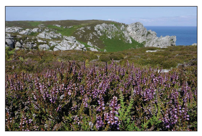
Plate 2. An example of the Calluna vulgaris dominated lowland heathland at the north end of Lundy.