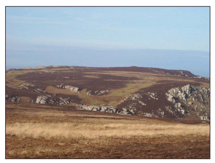
Plate 1: Calluna vulgaris-dominated lowland heathland at the north end of Lundy.

The lowland heathland sites were defined as areas below 300m elevation in which ground coverage of Calluna vulgaris was \geq 25\% . An example of the heathland on Lundy is given in Plate 1. To place the heathland on Lundy in a national perspective, data were compared with 25 other sites on the British mainland, with nitrogen deposition levels above and below that on Lundy. All 25 sites had an annual rainfall in the range 549-836mm per annum, with Lundy falling within that range (774mm). Modelled values of current N deposition at the heathland sites were obtained from 5x5km gridded data sets provided by R.I. Smith (pers. comm., CEH, Edinburgh). The data were derived using an atmospheric deposition model parameterised for moorland terrain (Smith & Fowler, 2001). The model uses a simulated rainfall field for the UK generated by the UK Meteorological Office (data from which was also available for this study), and interpolated N deposition maps derived using measurements from the UK Acid Deposition Monitoring Network (AEA Technology plc., Didcot, UK).