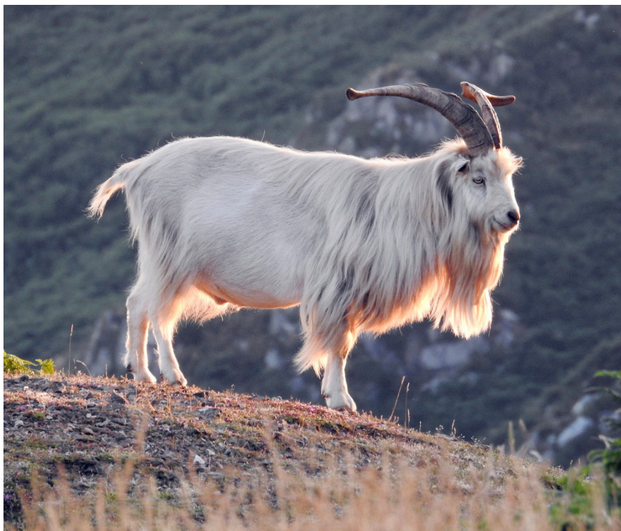
▲ Wingnut (photo: Chris Blackmore).

The slow recovery in numbers continues with no reported outbreaks of Myxomatosis or Rabbit Viral Haemorrhagic Disease, although four carcasses were reported and on 10 th December one was seen near the steps at North Light by Anna Northam who recorded, 'it didn't appear to hear me approaching and the right eye was opaque so probably no vision'. This could possibly have been a diseased animal. Highest counts were increased on 2023 numbers with 18 recorded between the Castle and Old Light on 8 th June by P St. Pierre and C Lock, 12 on the Main Track and North End Sidelands with a thermal imager on 10 th June by J Parker, 25 in the Village 'dazzling route' on 28 th September by J Parker and 10 on a nocturnal survey on 10 th January by J Parker. One was also seen with puffins at St Martin's Stone on 16 th June by L Pecasse. Please do continue to record your rabbit sightings.