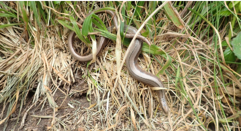
▲ Slow worm by 'Village' sign by Millcombe, June.