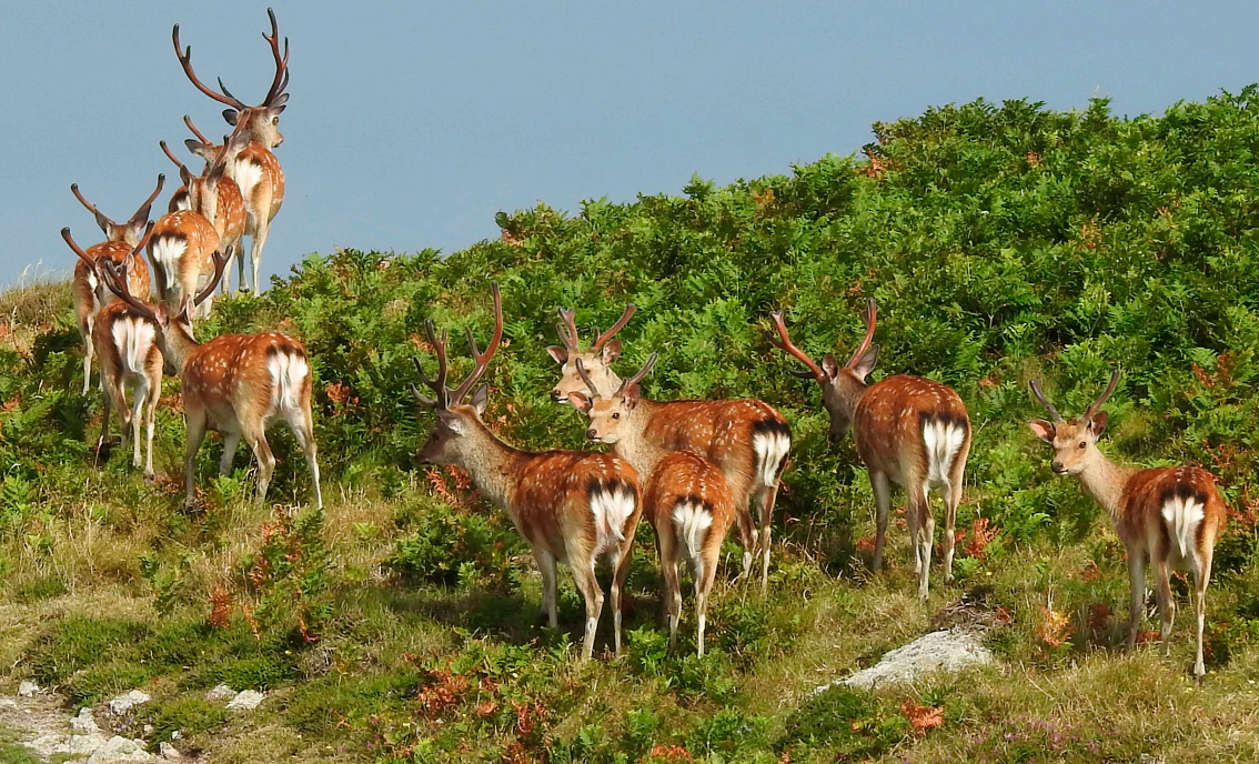
▲ Sika conga.