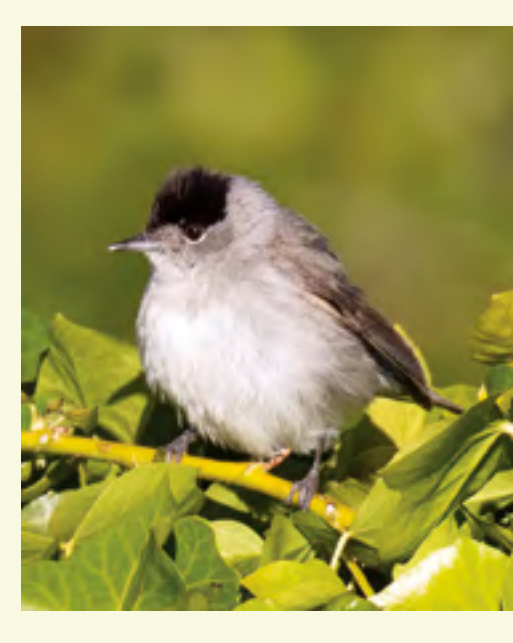
▲ Male Blackcap, Millcombe.

▼ Whimbrel, Tent Field, 27th April.