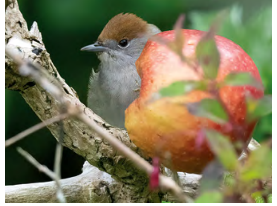
▲ Female Blackcap, Millcombe, 17th June.