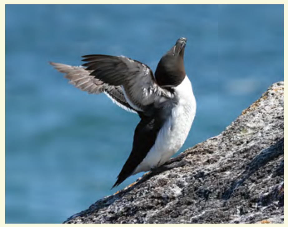
▲ Razorbill, Jenny's Cove.

In addition, confirmed breeding attempts were made by Blackcap and Teal but no young are known to have fledged. Storm Petrel almost certainly bred near North Light, Brazen Ward and at the Battery.