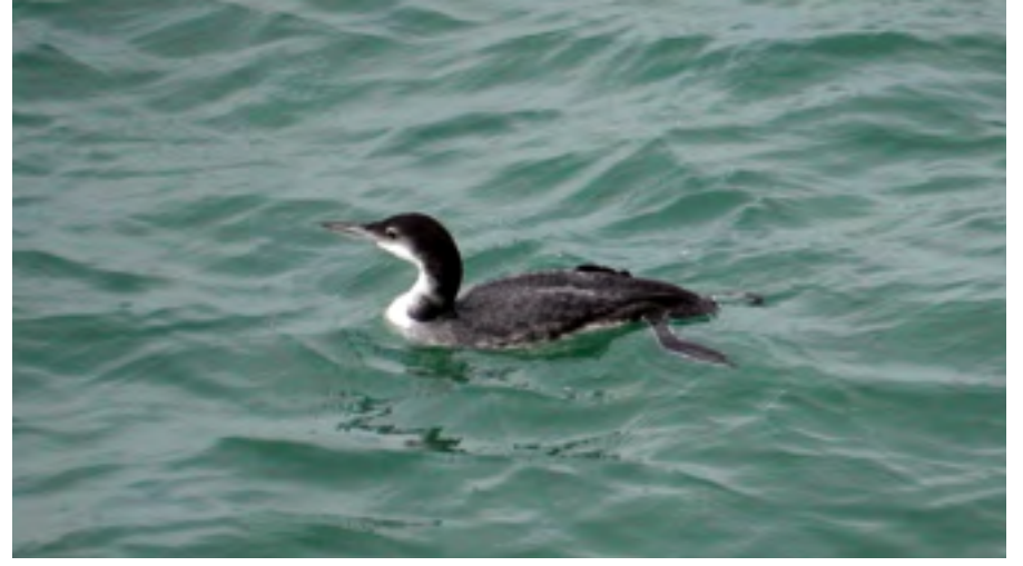
▲ Great Northern Diver, Landing Bay, 24th November.