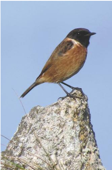
Stonechat Saxicola rubicola , near Quarter Wall, 14 October 2015. © Tim Davis