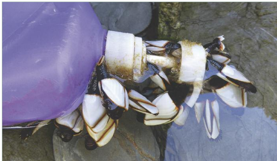
Above: Pelagic gooseneck barnacle Lepas anatifera cluster on a plastic bottle at Hell's Gates, 25 July 2015.