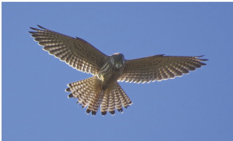
Above: Kestrel Falco tinnunculus , Terrace, 5 October 2015. Below: Treecreeper Certhia familiaris , Terrace, 13 September 2015.