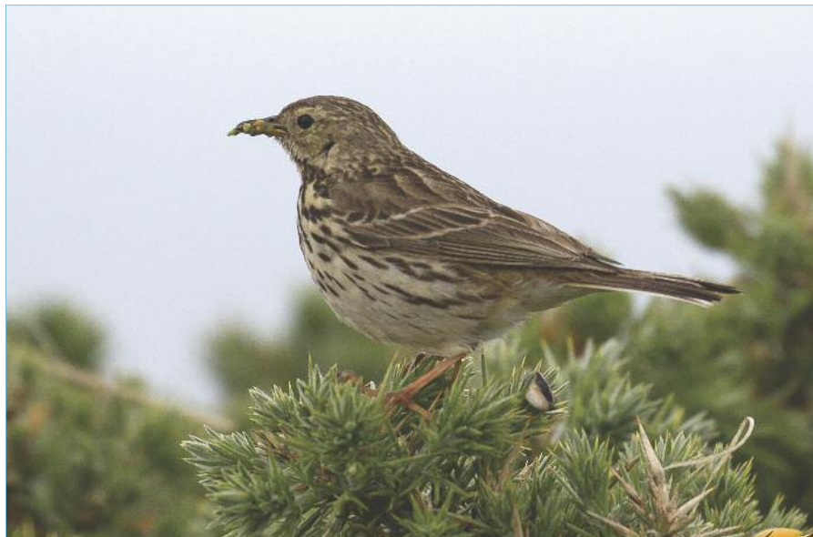
Above: Meadow Pipit Anthus pratensis , near Pondsbury, 12 June 2015.