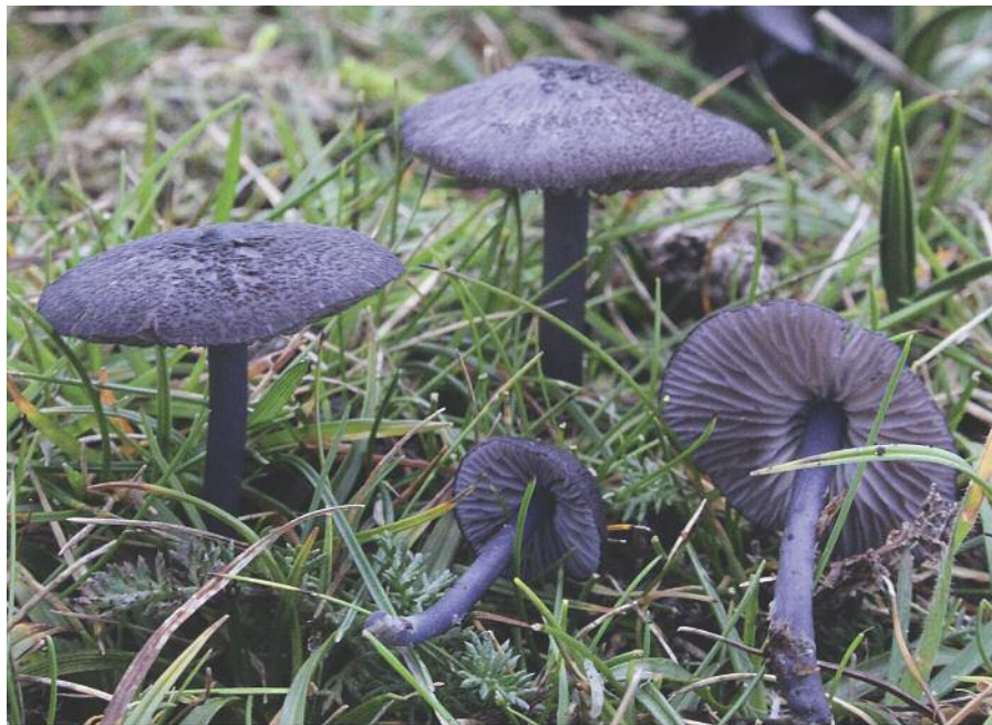
Above: Azure pinkgill Entoloma chalybdaeum var lazulinum in short turf, Old Hospital.