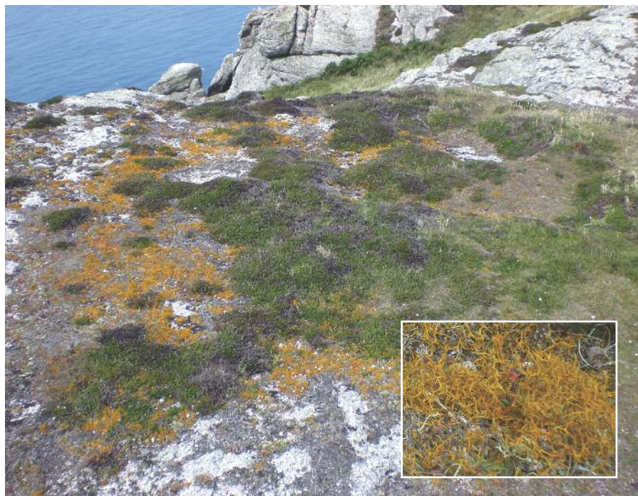
Above: Golden-hair lichen Teloschistes flavicans , near Dead Cow Point, 16 July 2015.