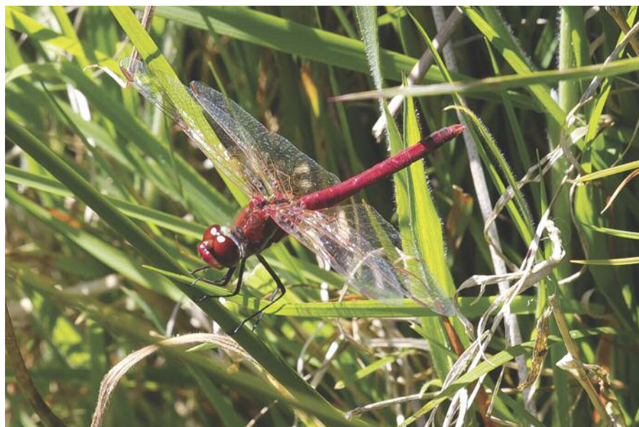
Below: Red-veined darter Sympetrum fonscolombii , Ponsbury, 6 June 2015 – a first for Lundy.