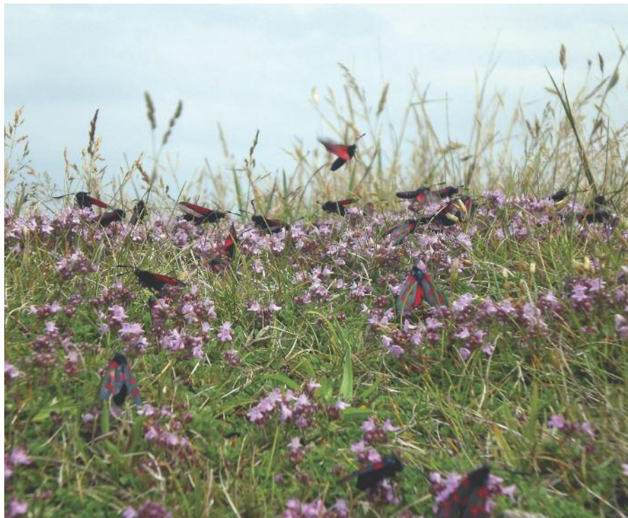
Above: Six-spot burnet moth Zygaena filipendulae emergence, Castle Hill, 16 July 2015.