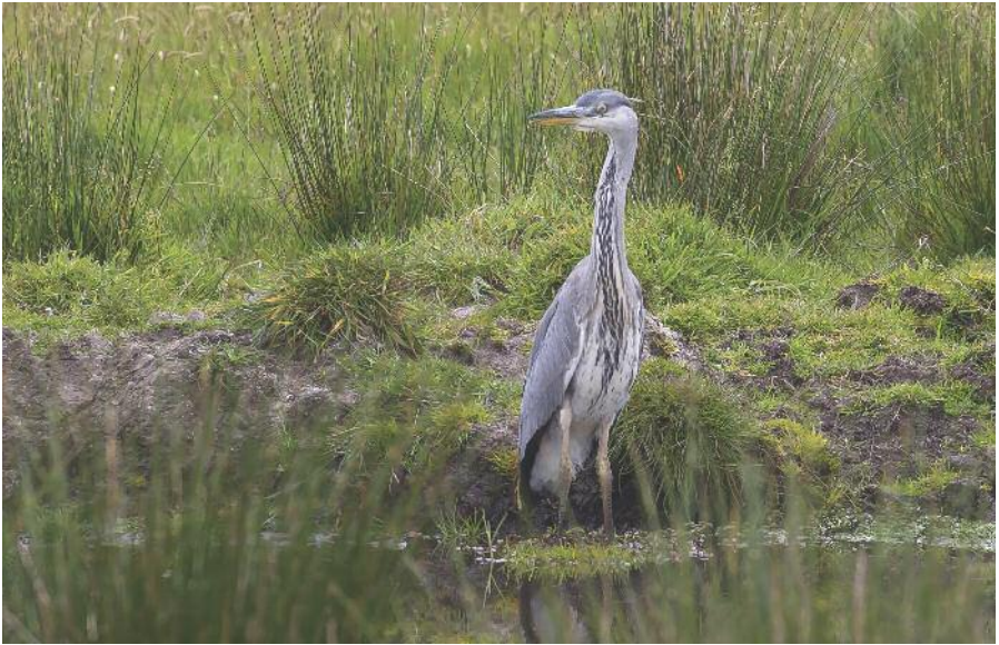
Clockwise from top: Grey Heron Ardea cinerea , Brick Field Pond, 12 June 2015.