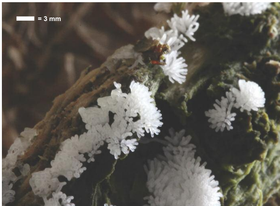
Above: Snowy slime mould Ceratiomyxa fruticulosa on Rhododendron wood, Quarter Wall Copse. Below: Star pinkgill Entoloma conferendum in short turf near the Old Hospital.