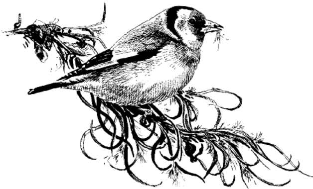
Goldfinch by Mike Langman, from 'The Birds of Lundy'

Numbers in brackets indicate pulli ringed in 2014 (included in the main totals). Number of species: 48