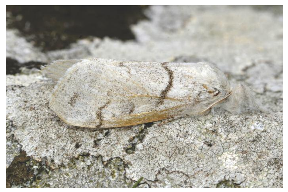
Above: Pale tussock Calliteara pudibunda, Walled Gardens and Casbah, 19 May 2014. Below: Scalloped hazel Odontopera bidentata, Walled Gardens, 19 May 2014.