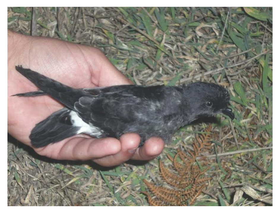
Above: Storm Petrel Hydrobates pelagicus chick, West Sidelands, 5 October 2014. Below: Waxwing Bombycilla garrulus , adult male, upper Millcombe, 20 October 2014.