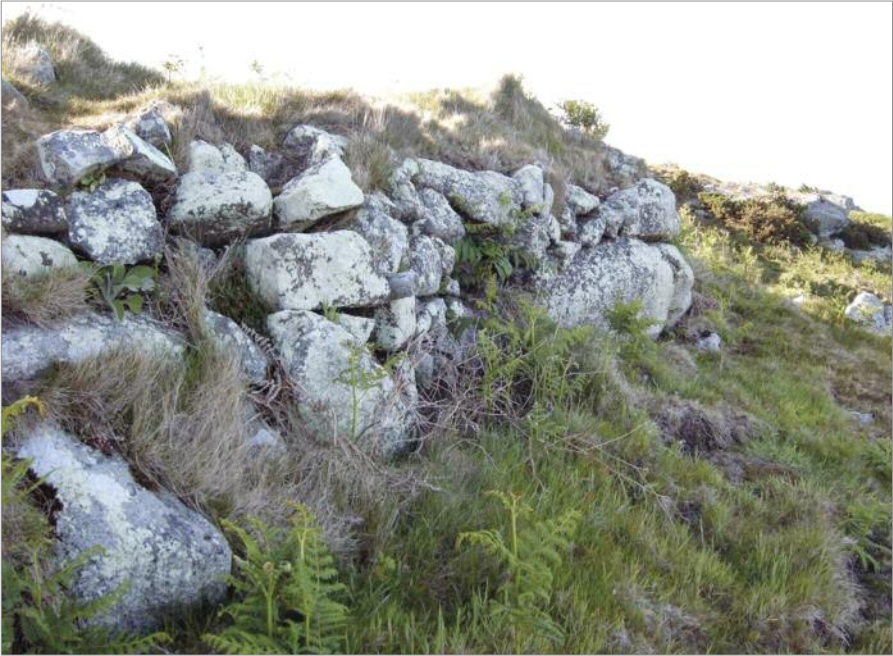
Figure 4. Wall running N-S on the eastern side of the island adjacent to livestock fields, marked as 28 in Figure 1 and considered of moderate suitability in Mark Bolton's assessment.