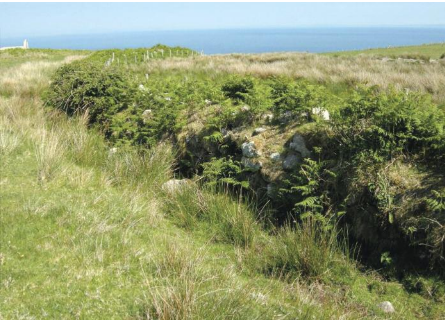
Figure 5. Eastern side of Quarter Wall. Not considered suitable owing to extensive bracken growth at the base.