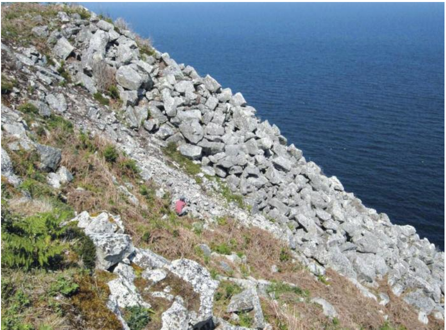
Figure 3. East Side quarry spoil. Parts of this area were considered of high potential for nesting Storm Petrels (marked as 19 to 24 in Figure 1).