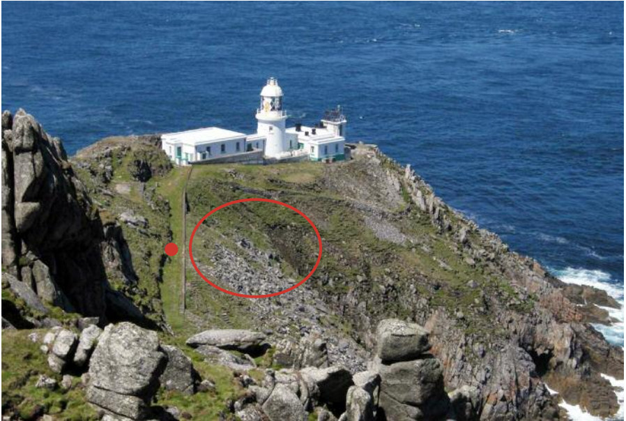
Figure 2. North Light. The area considered of high potential for nesting Storm Petrels in Mark Bolton's 2004 assessment is shown in the red circle (marked as 17 in Figure 1). The red dot was the location of a night watch on 3-4 June when no Storm Petrels were heard but numerous Manx Shearwaters were passing, arriving and leaving burrows.