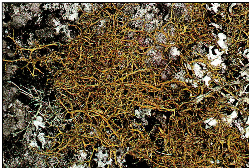
Plate 1: Top: Acarospora smaragdula (x3), in copper run off from gravestone showing two forms - yellow-green due to uptake of copper salts and pale brown with dark apothecia without obvious copper uptake; Bottom: Teloschistes flavicans (x0.6). (Photos: Ann Allen). This accompanies the paper by James, Allen and Hilton.