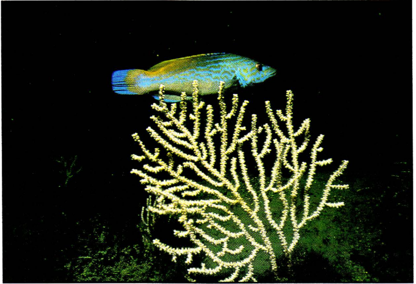
Plate 1: Brightly coloured cuckoo wrasse and sea fan in Quarry Bay.. From Eckersley's paper.