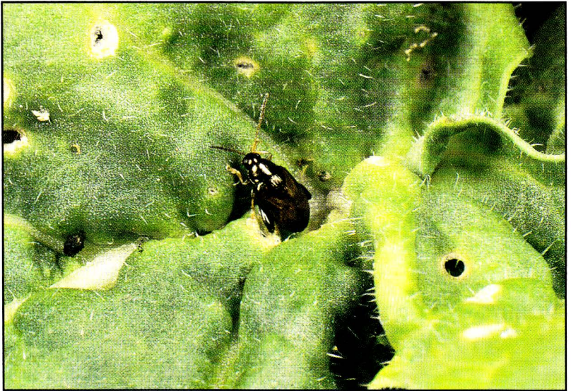
Plate 2: Psylliodes luridipennis on Lundy Cabbage, July 1993. This beetle lives on Lundy Cabbage and occurs nowhere else in the World. From list of other invertebrate records.