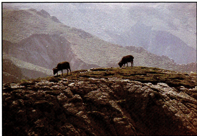
Plate 4: Part of Lundy Soay flock, established in 1944 and now with 114 animals (from Gulland's paper)