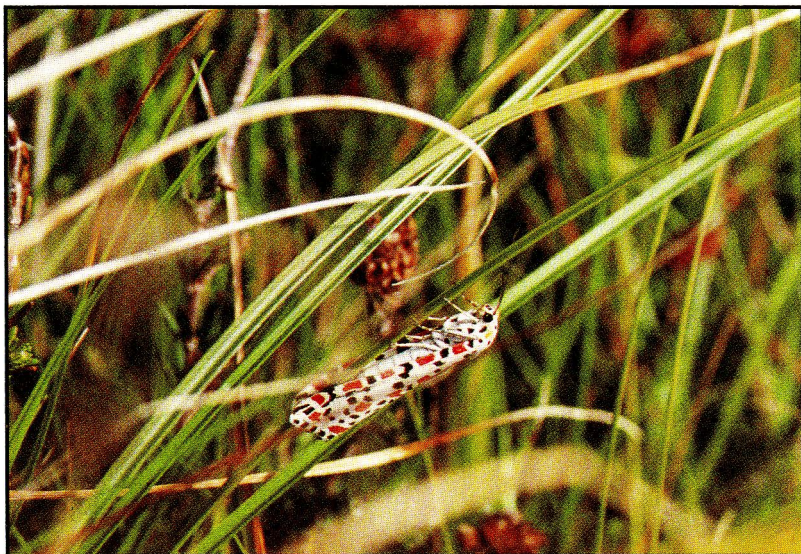
Plate 3: The Crimson Speckled moth Utetheisa pulchella (L.), seen on Lundy 29th September 1992, near Pondsburry. This is a rare visitor from the warmer south.