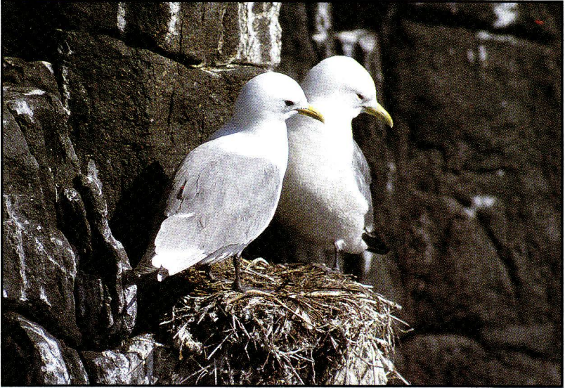
Kittiwakes Rissa tridactyla : the 1992 survey of breeding seabirds found a marked decline in their numbers