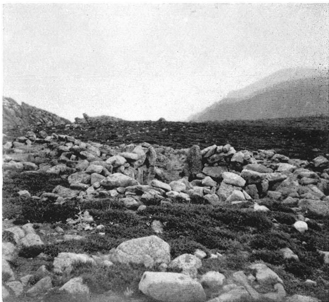
ONE OF THE HUTS